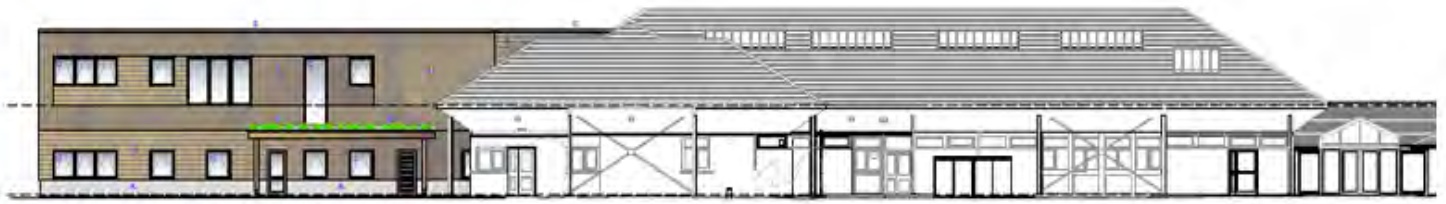
Proposed East Elevation (East)