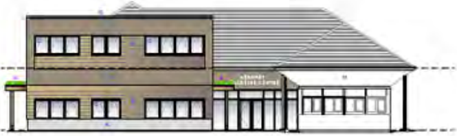
Proposed South Elevation (South)